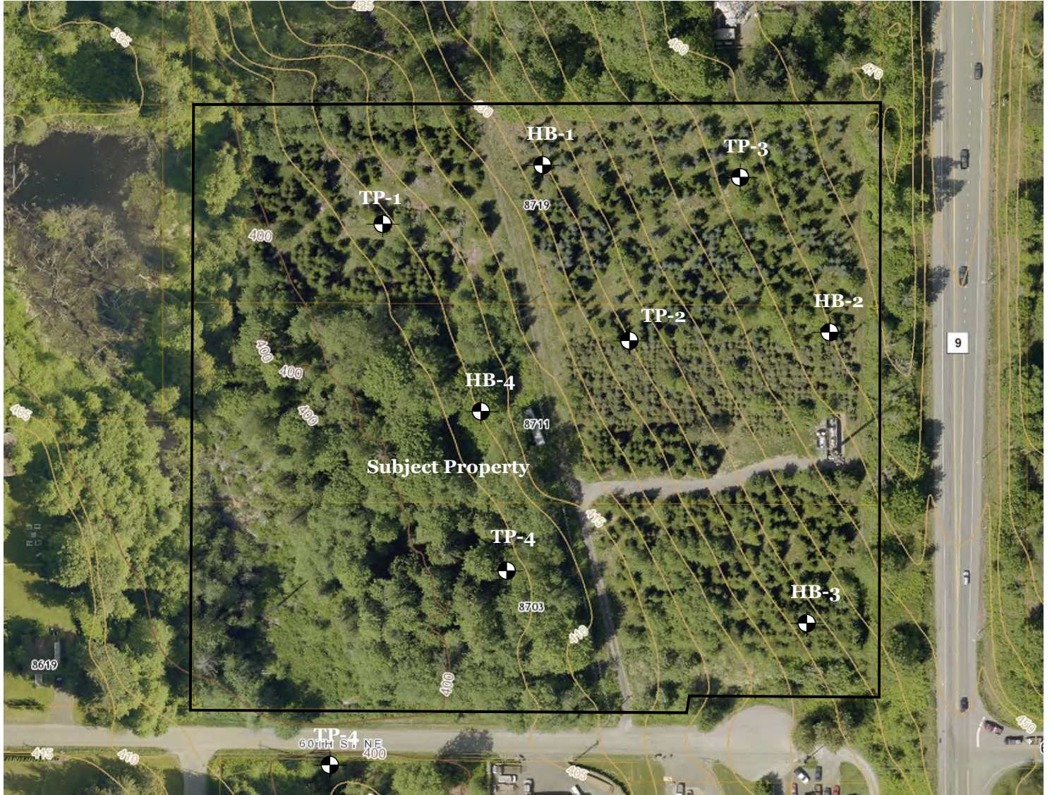
Sno. Co. GIS Aerial Photo