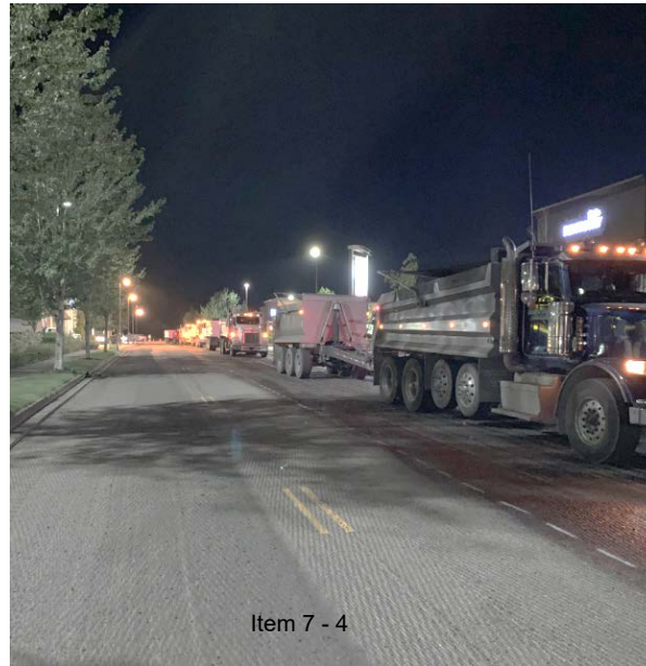
Item 7 - 4