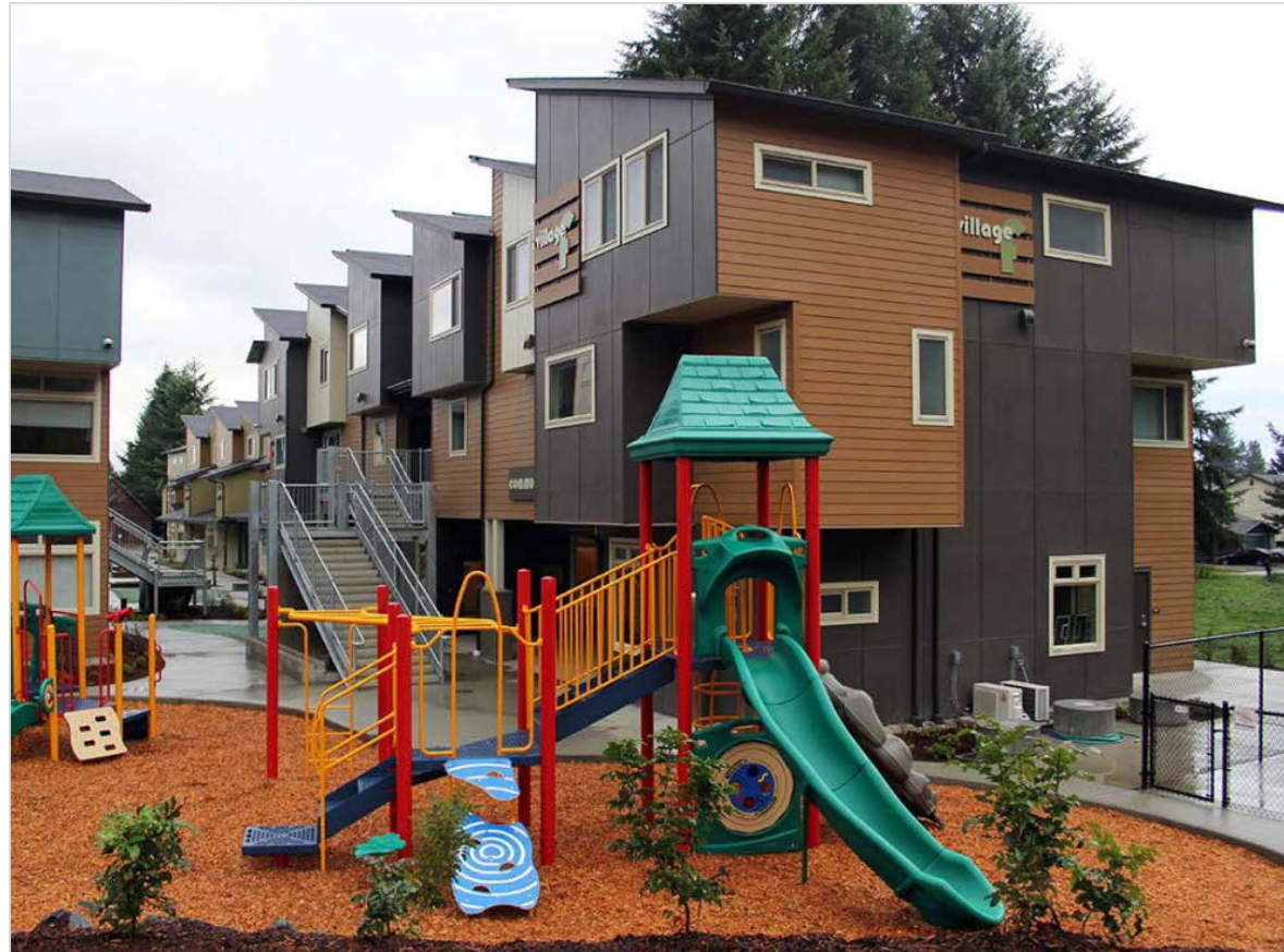
Housing Hope's Monroe Family Village – 1 shelter, 9 homeless and 37 low-income homes, all for families.

Without a home, this becomes difficult or impossible.