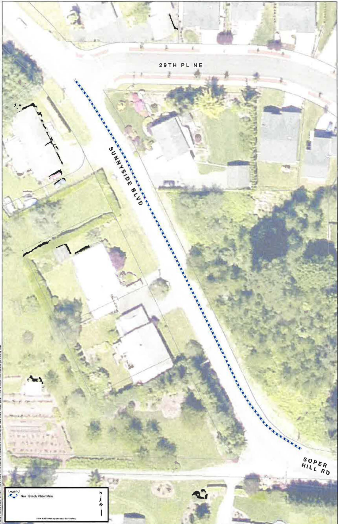
SUNNYSIDE BLVD WATER MAIN (29TH PL NE TO SOPER HILL RD) - VICINITY MAP