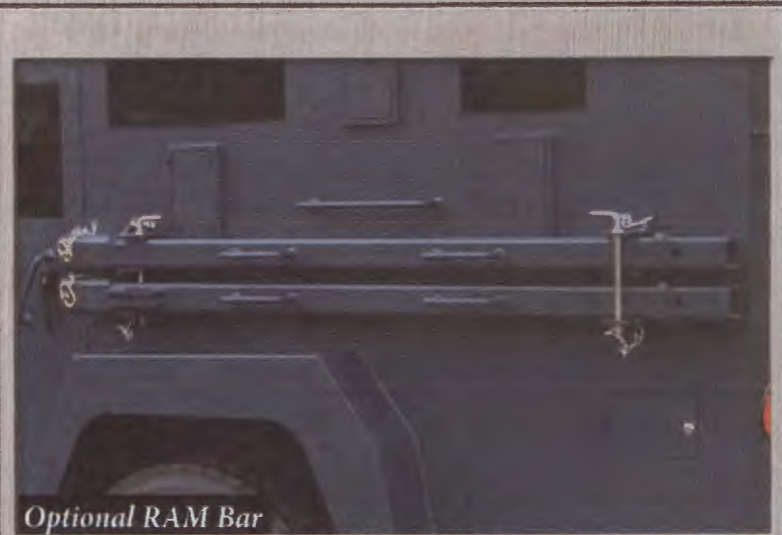
Optional RAM Bar