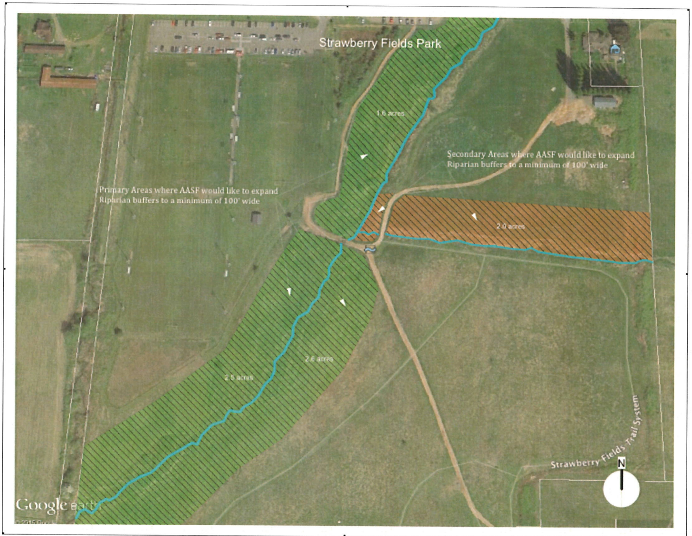
EXHIBIT C STRAWBERRY FIELDS BUFFER ENHANCEMENT