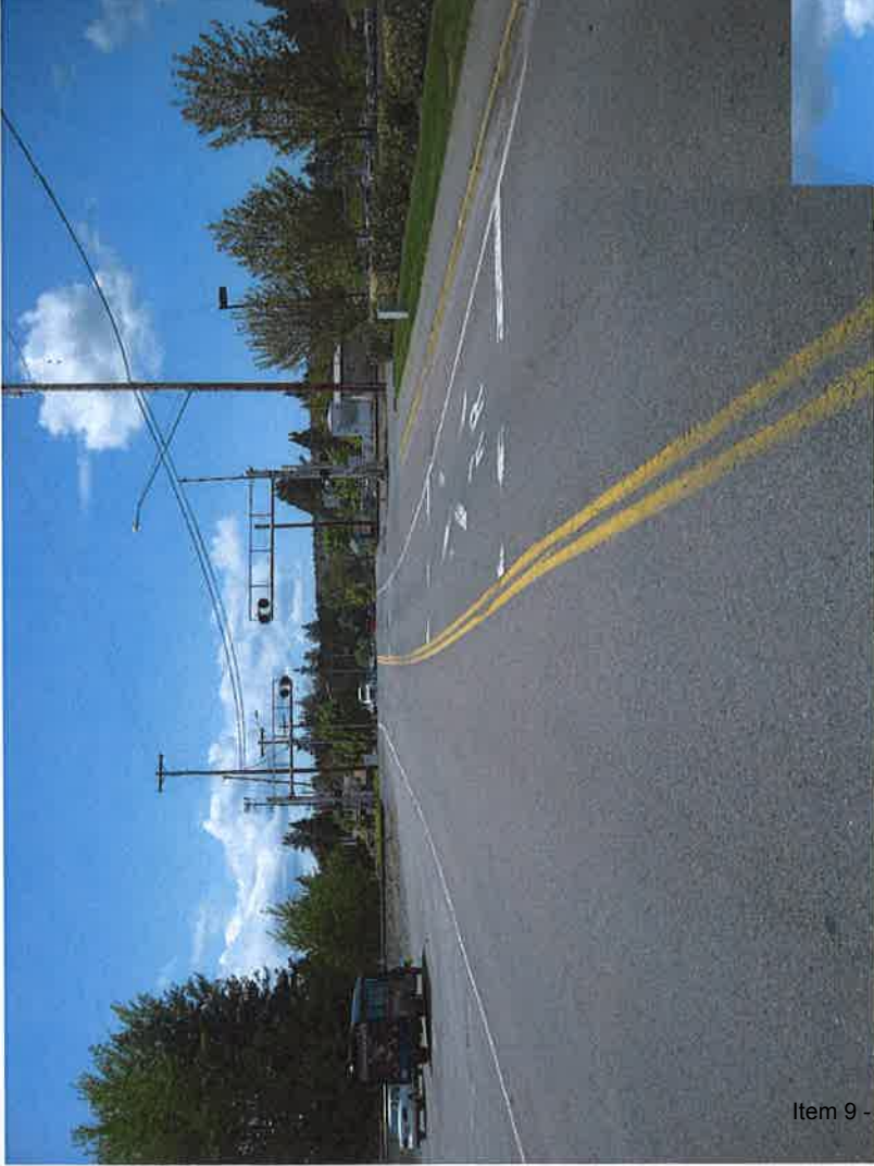
Item 9 - 3

$136,749 TIB Grant $276,500 Ped & Bike Grant $ 34,523 TBD Funds