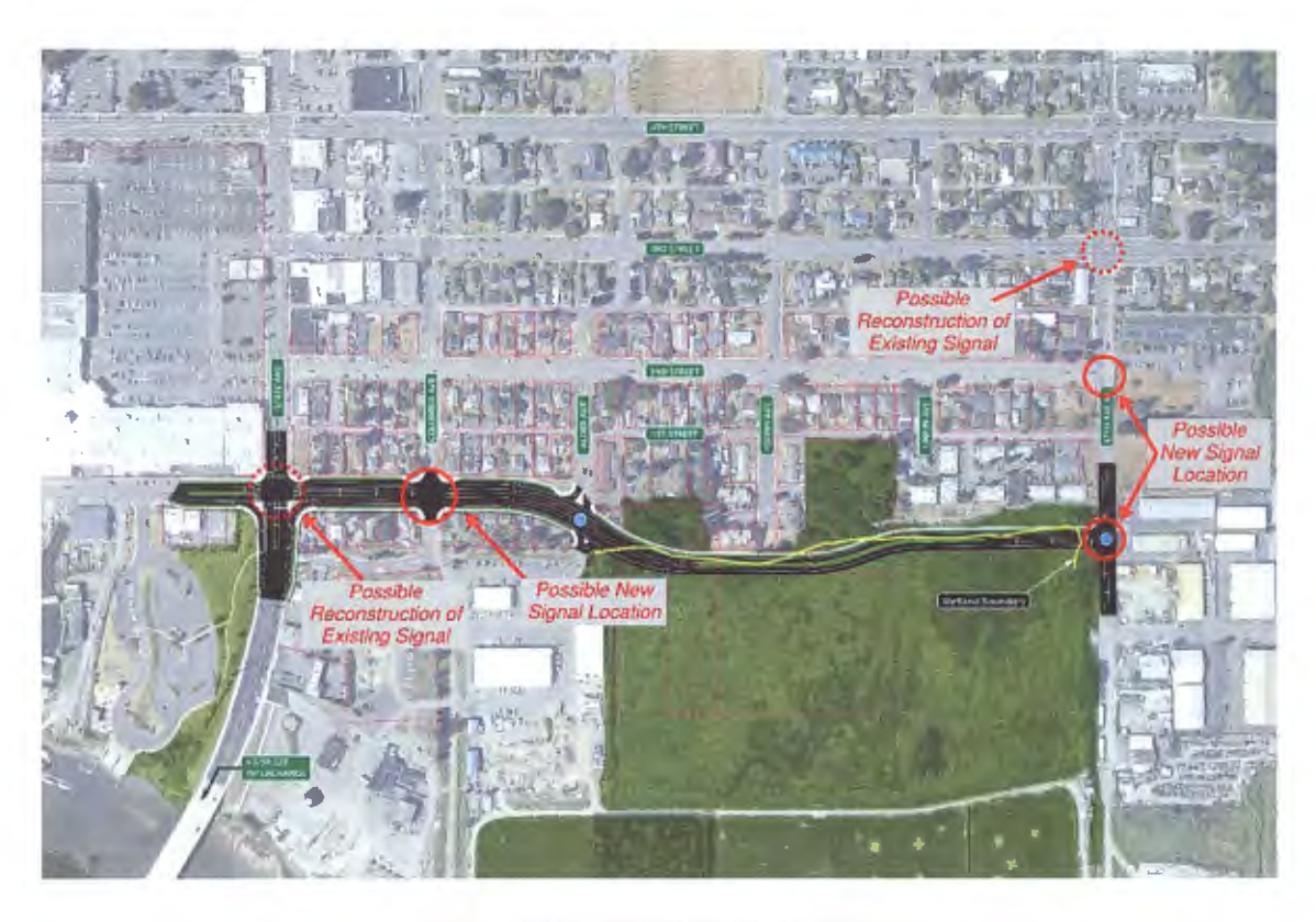
Figure 1: Possible Signal Locations.

SUBCONSULTANT shall complete signal and illumination design as required for the First Street bypass. This work shall include illumination design for up to 3,000 linear feet of new roadway and 3,000 linear feet of existing roadway, and signal design for one new and up to three reconstructed signalized intersections (including the proposed bypass and parallel improvements as needed to be determined by the preliminary project planning).