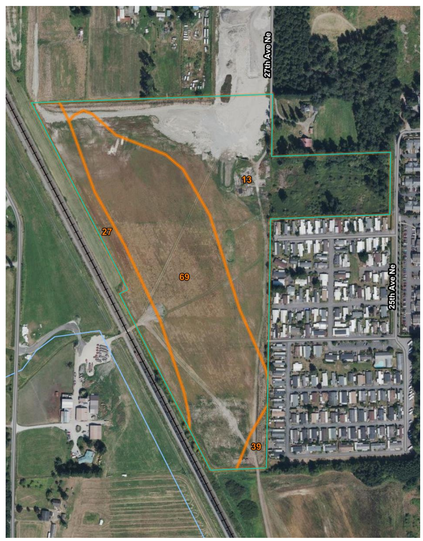
Figure 5 – Soil Map (Not to Scale)