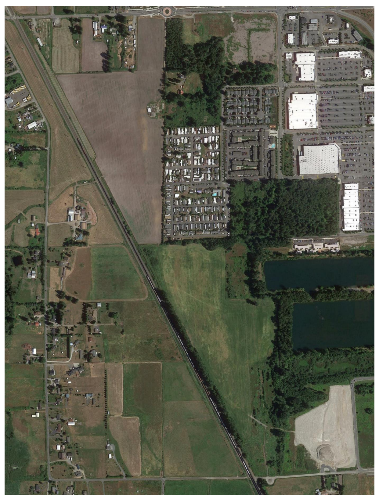
Figure 2 - Existing Conditions (not to scale)