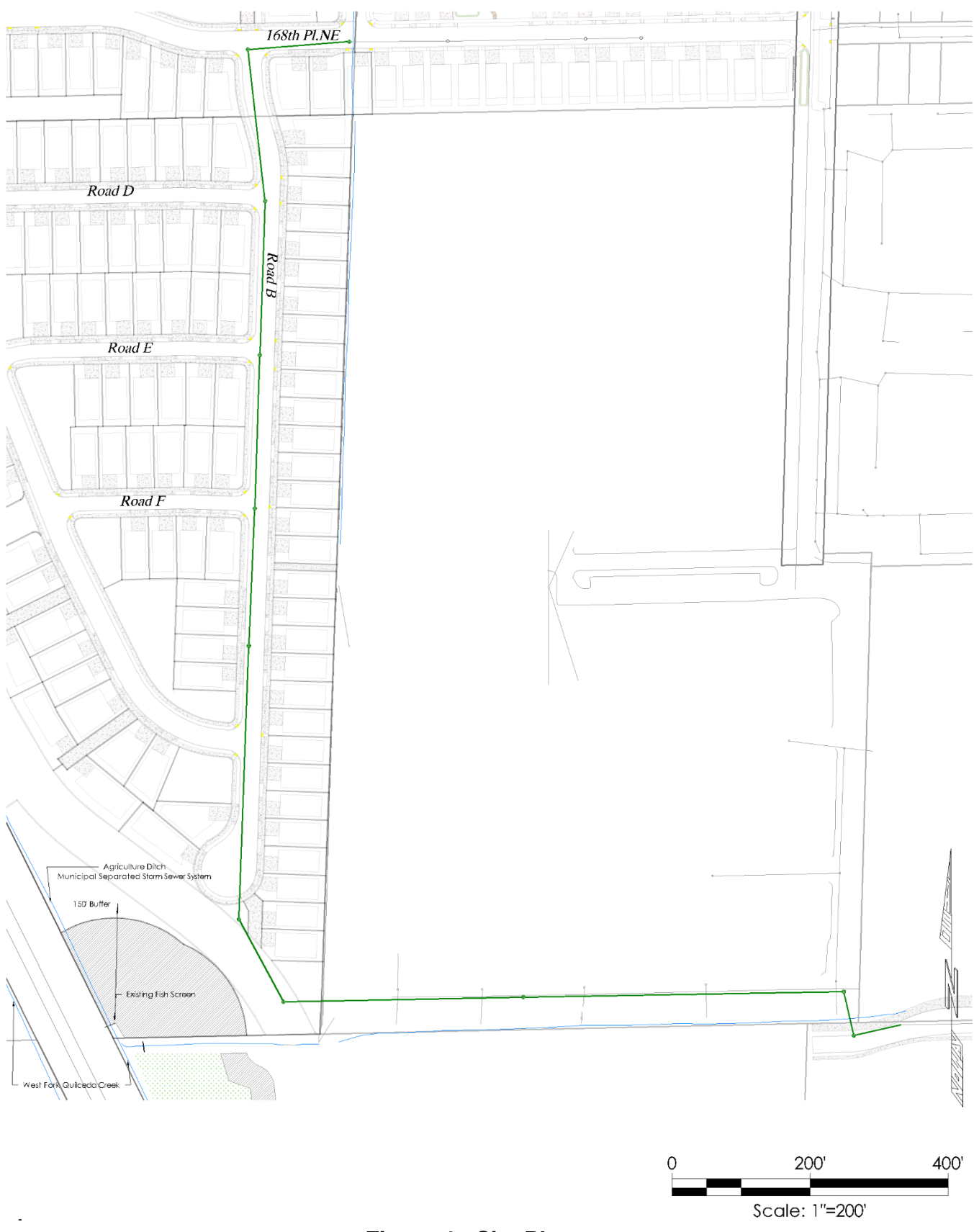
Figure 4 - Site Plan