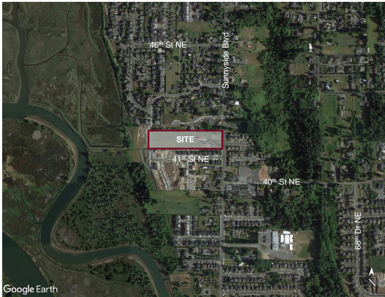
Figure 1: Site Vicinity Map

Kimley-Horn and Associates, Inc. has been retained to provide a traffic analysis for the Olympic Vista development. The site is located along the west side of Sunnyside Boulevard north of 41 st Street NE. A site vicinity map is included in Figure 1.