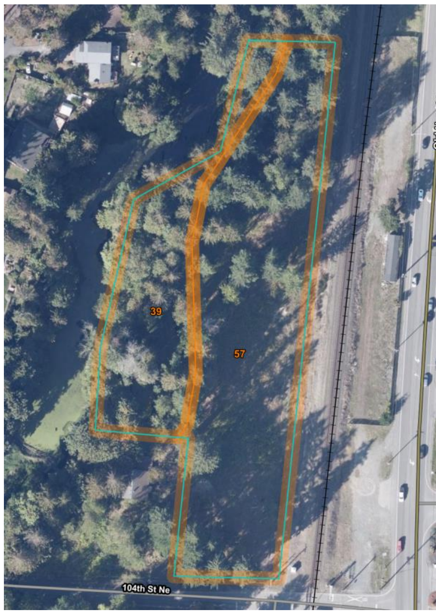
Figure 5 – Soil Map (Not to Scale)