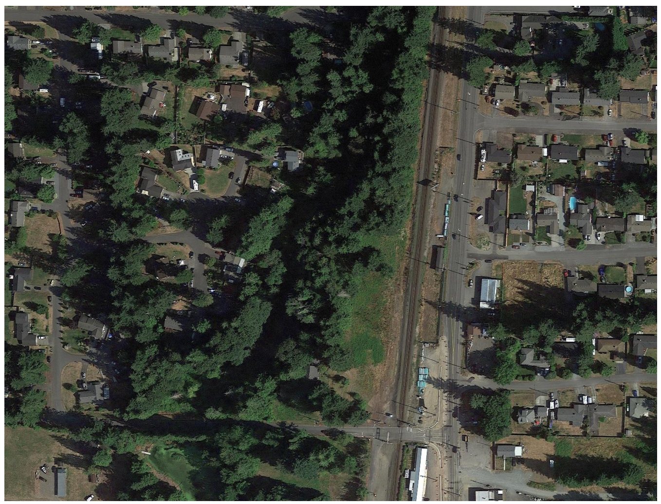
Figure 2 - Existing Conditions (not to scale)