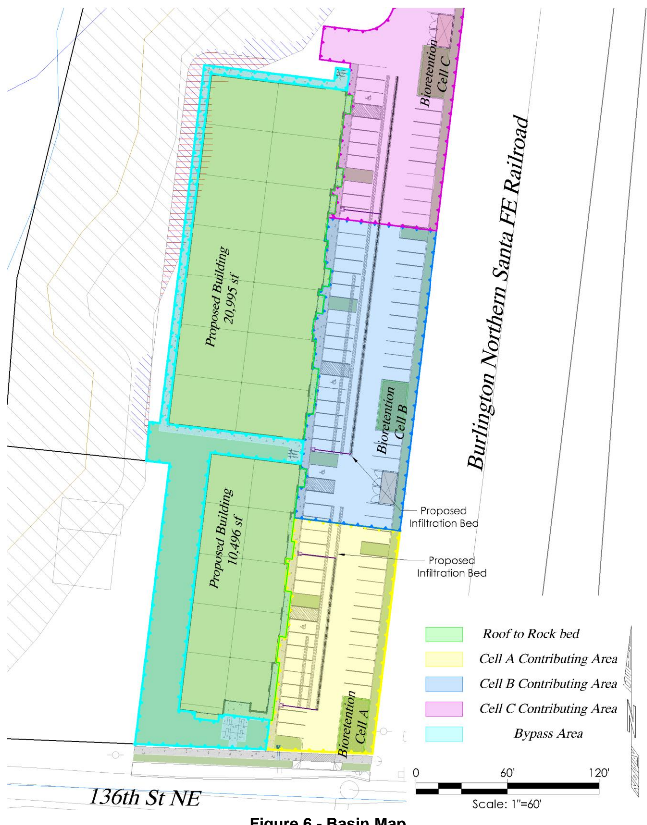
Figure 6 - Basin Map