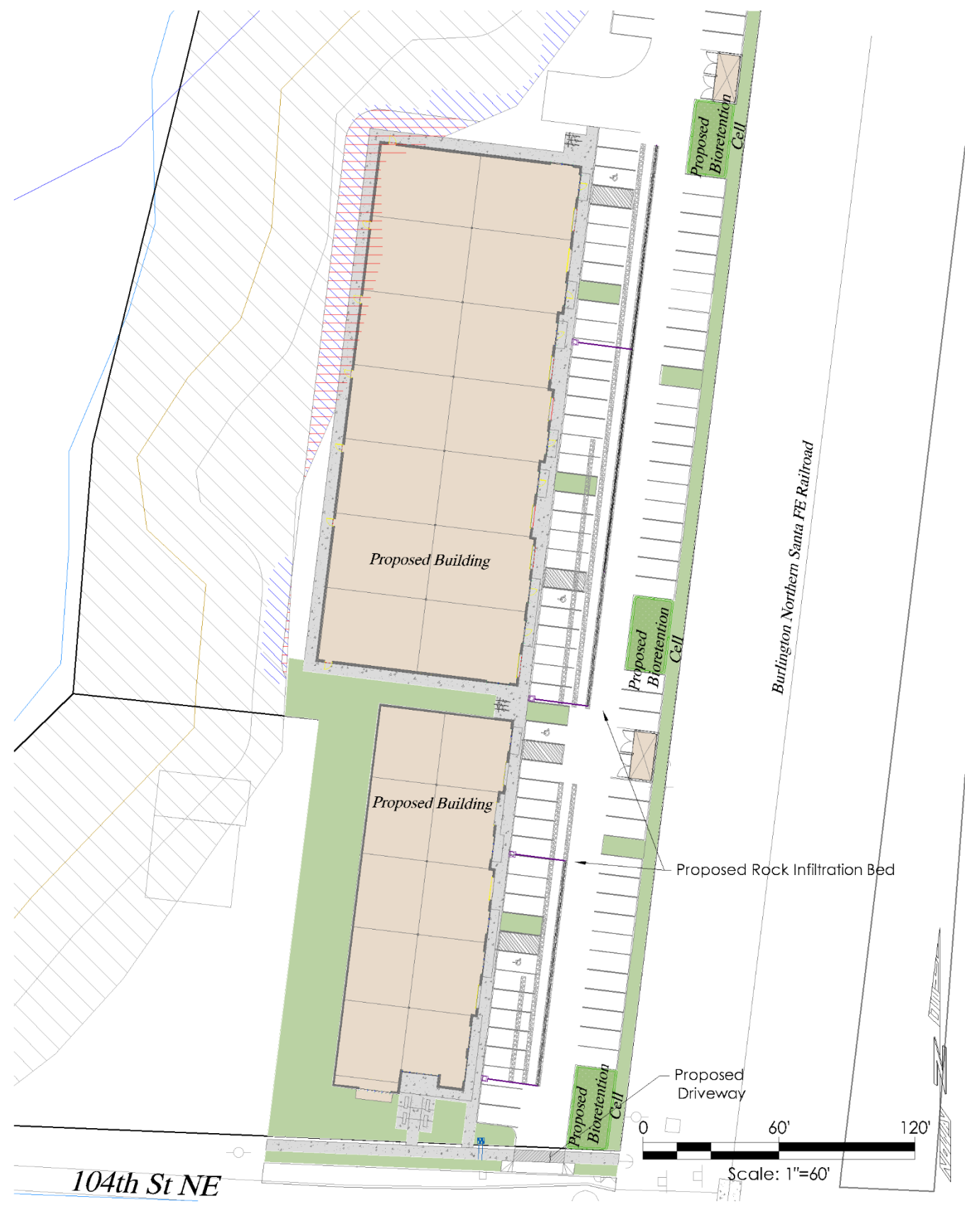
Figure 4 - Site Plan