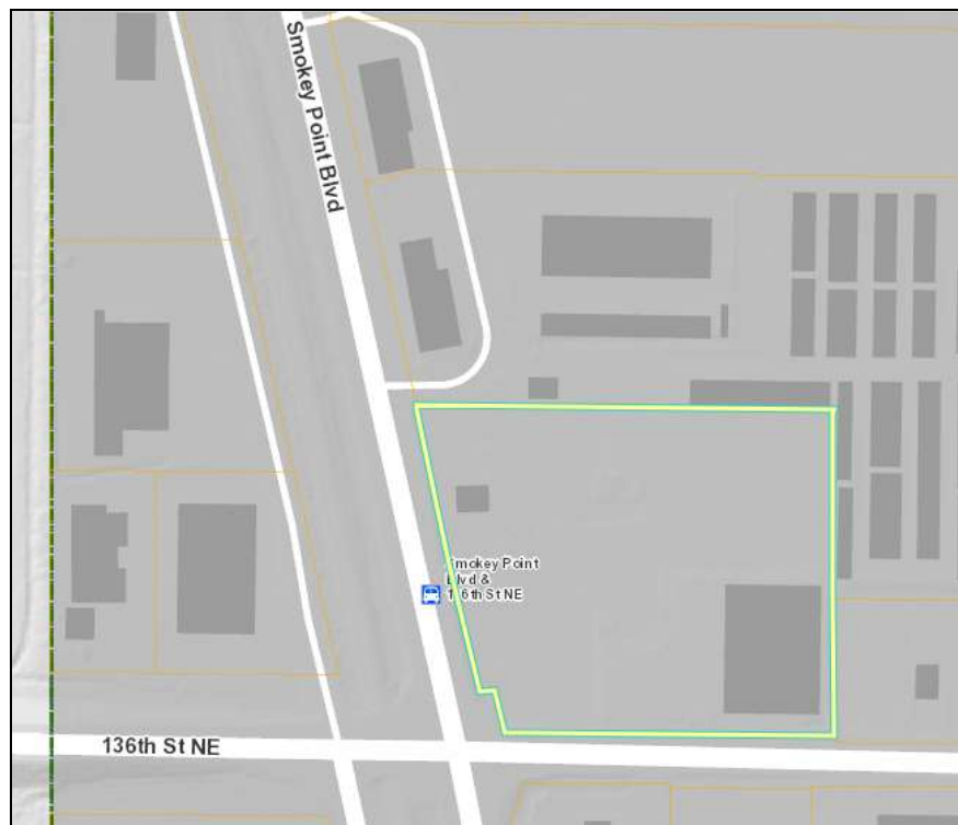
Above: Vicinity Map of the site.

This report describes our observations of any jurisdictional wetlands, streams and buffers on c Parcel #30050400200500, located at 3803 36 th Street NE, in the City of Marysville, Washington.