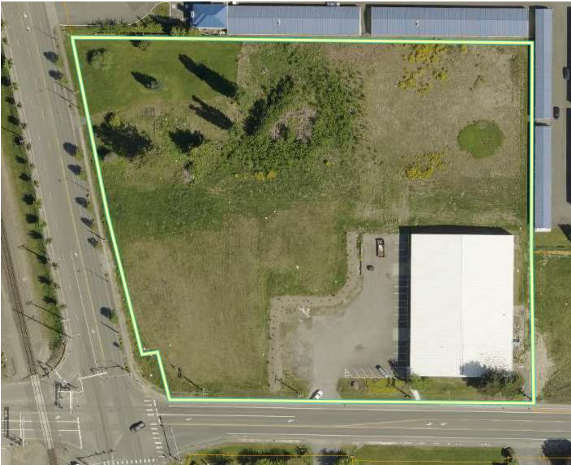
Above: 2020 aerial photograph of the site, note structure removed.

The site contains a single commercial structure in the southeast corner of the site with associated paved parking surfaces. The remainder of the site generally cleared mowed pasture area. Several Lombardy poplars and blackberry patches are located near the northwest side of the site where it appears a home was located in the past. The site has the appearance of being graded or disturbed in the past.