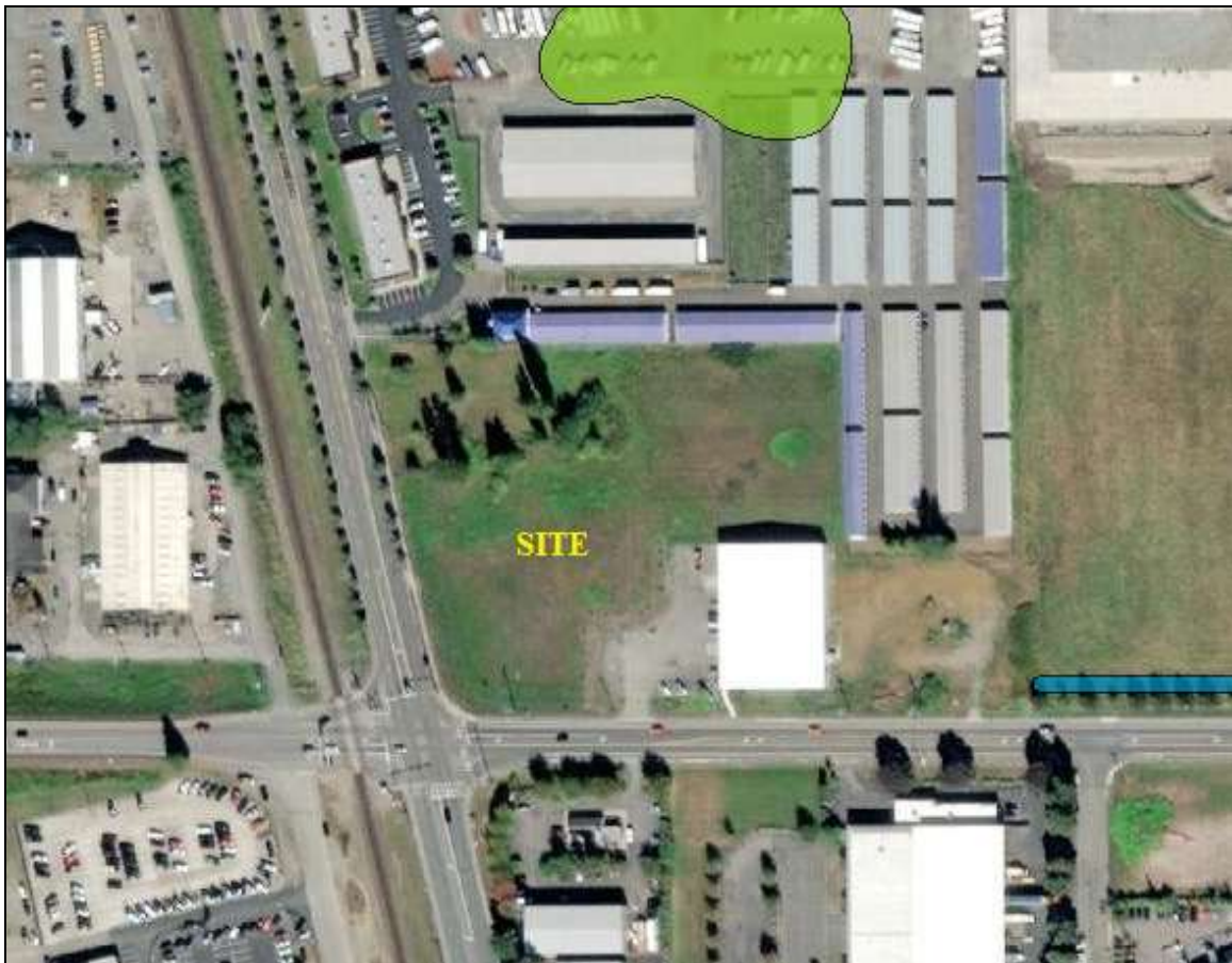
Above: NWI map of the area of the site