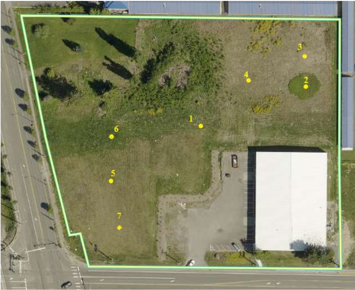
Above: Data point locations