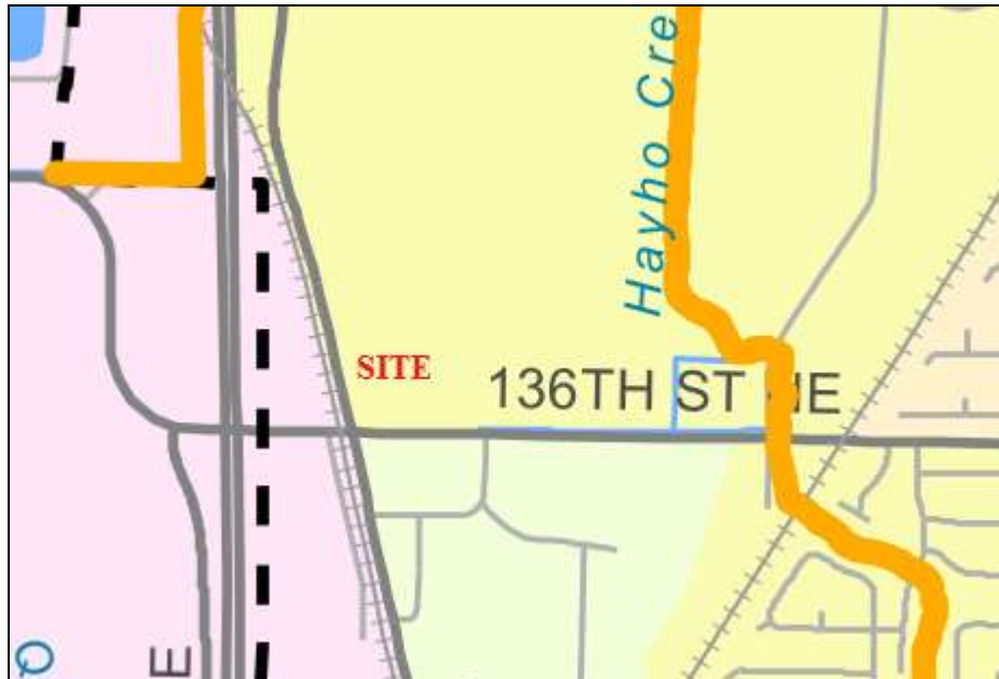
Above: City of Marysville Stream Classification mapping.