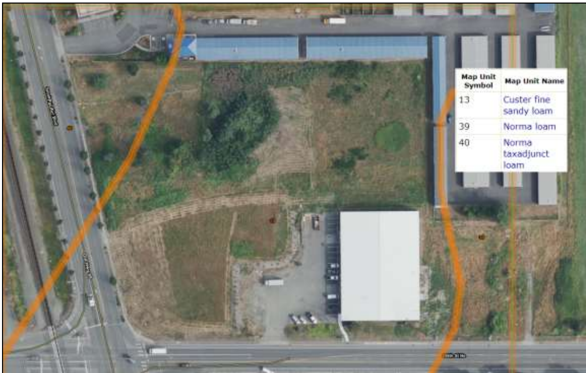
Above: NRCS soil map of the site.