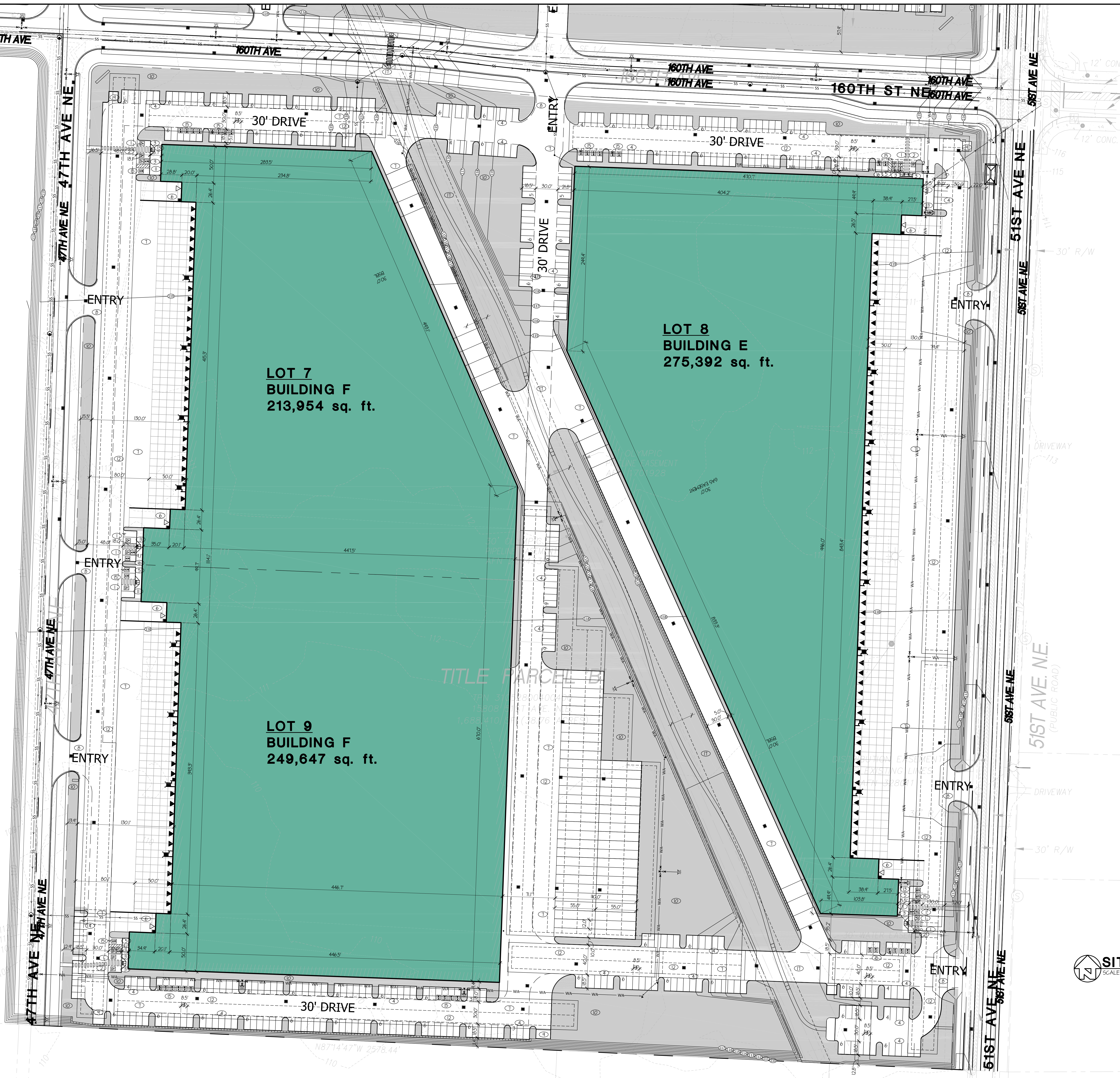
SITE PLAN SCALE: 1"=50'-0"